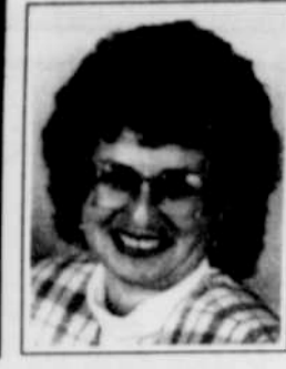
CRB, GRI Broker/Owner