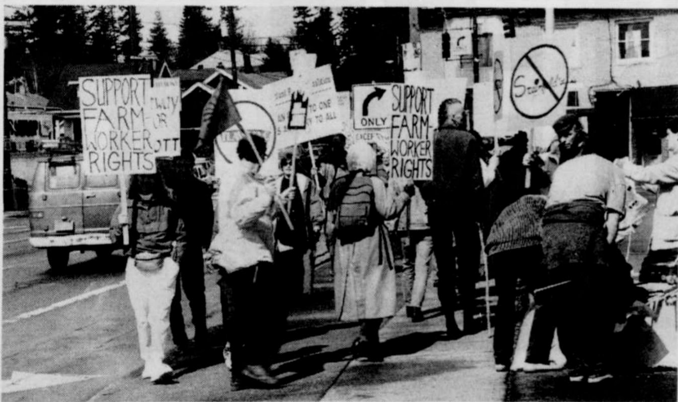
The scene at Lamb's Peacock Lane Thriftway on March 19.