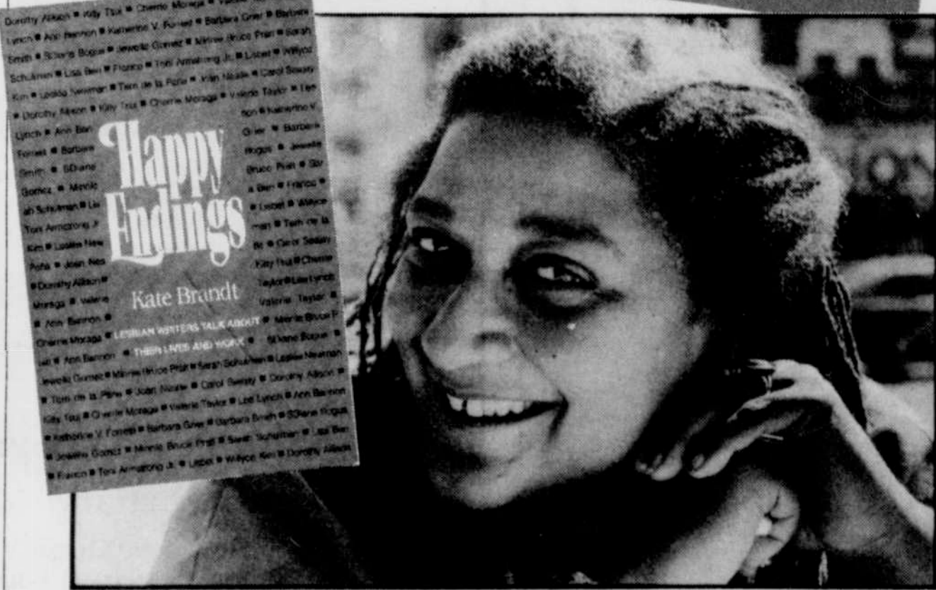
Jewelle Gomez speaks out in Kate Brandt's Happy Endings