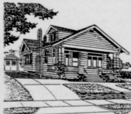
Rose City $116,000