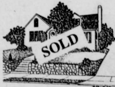
Grant Park - $124,500