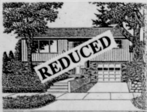
Splitsville to Hollywood. $99,500