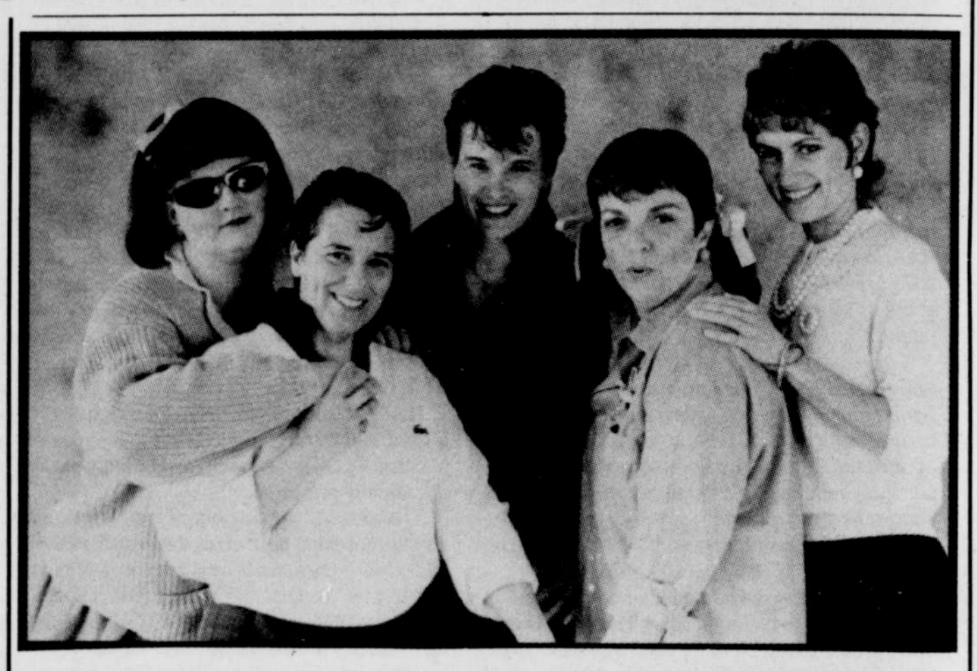
The Dyketones return to Portland for one show Friday, April 14, at the Echo Theatre.

The Fabulous Dyketones , originally from Portland, perform lesbian versions of 50s music and will have you laughing and dancing your shoes off. This concert is presented by Just Out as a celebration of A Woman's Place Bookstore's Sweet 16 Birthday. Dyketones Alumni are invited to do a number, and should call before April 10. (8:30 pm, Echo Theatre, 1515 SE Hawthorne, $7 in advance [tickets: A Woman's Place Bookstore and at the offices of Just Out], or $8 at the door, Renee LaChance, 236-1252.)