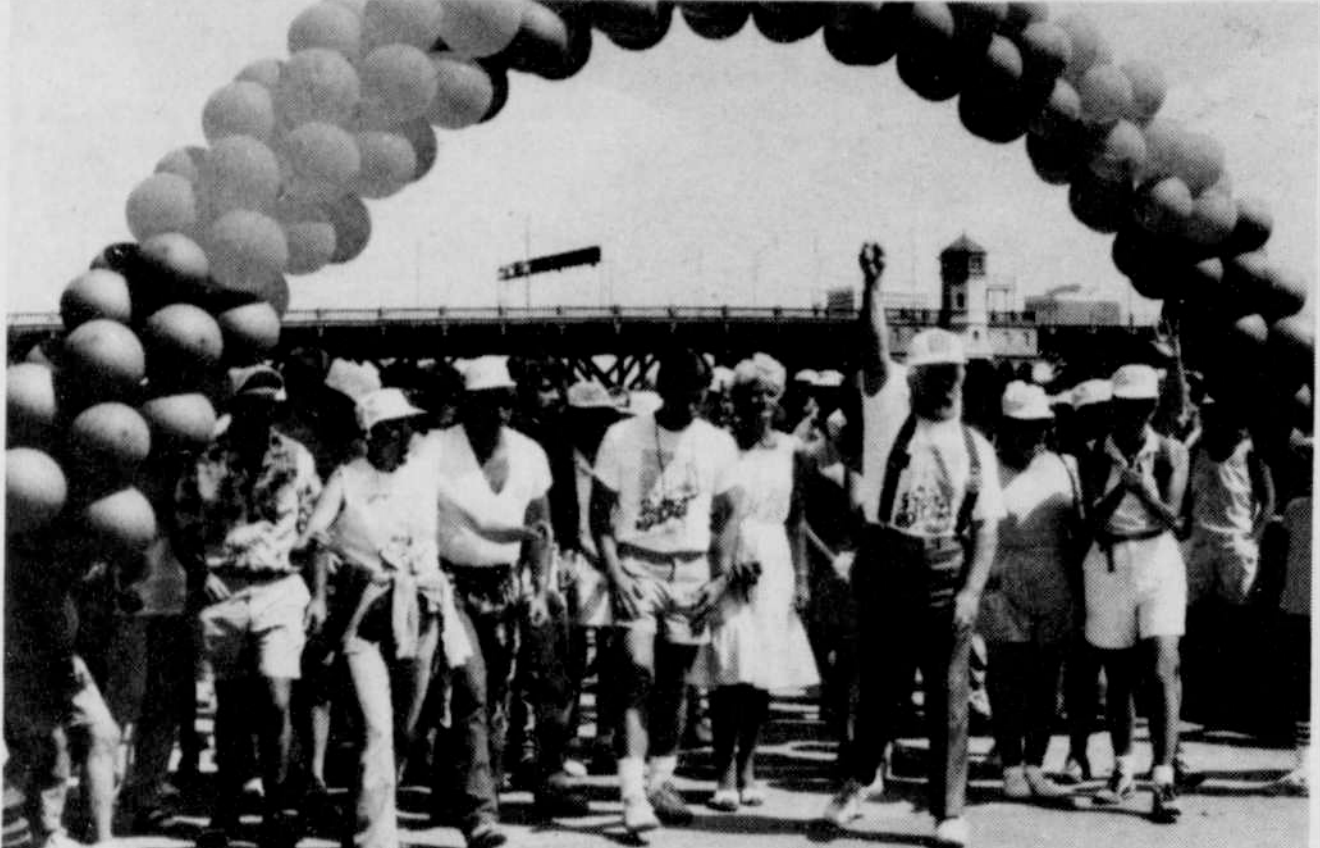
Mayor Bud Clark leads 1400 walkers who raised $110,000 at From All Walks of Life.