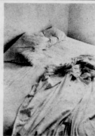
Unmade Bed

The Southern Oregon Lambda Association is a Rogue Valley-based organization of lesbians and gay men with a newsletter, fund-raising parties, AIDS education outreach, rap groups, outdoor activities and an annual statewide campout. (First Mondays, PO Box 4387, Medford, OR 97501, 773-8146.)