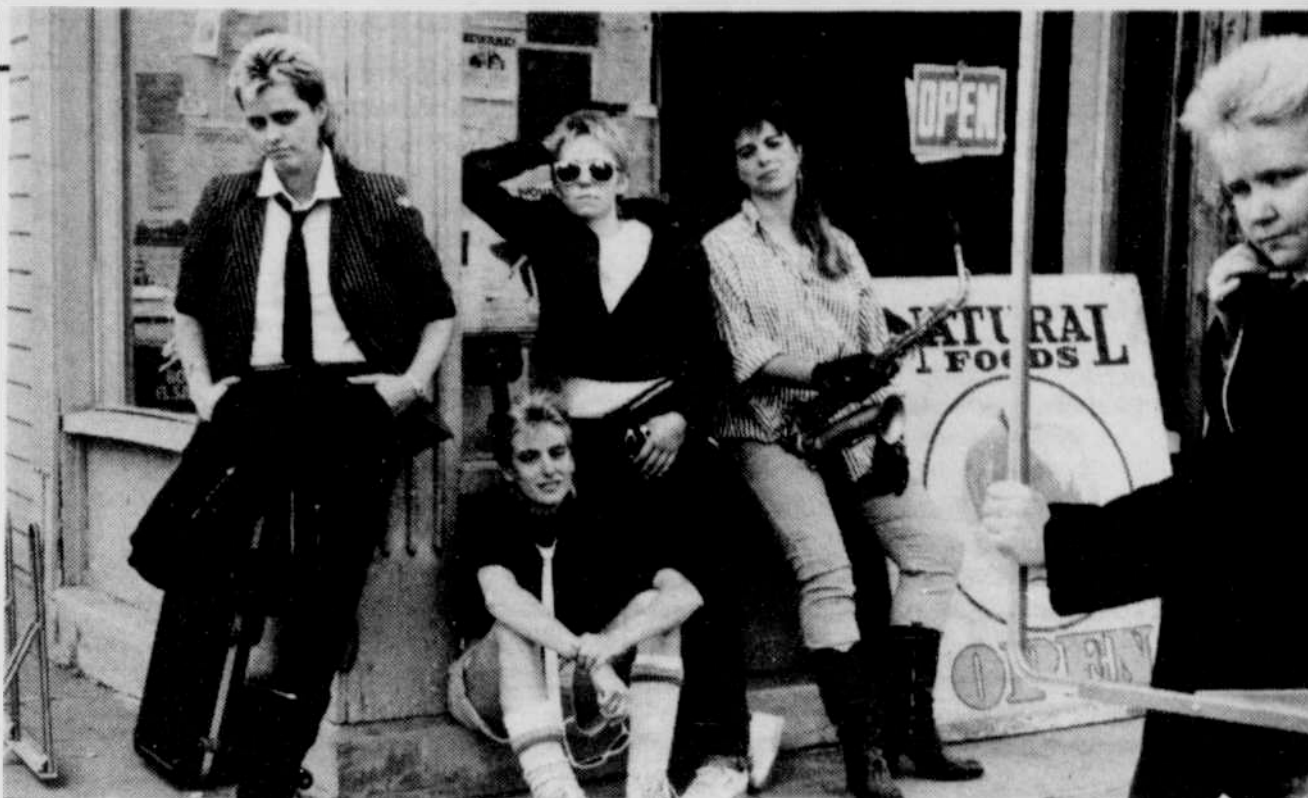
Portland's own Blues Sisters perform in a benefit for Oregon NARAL, January 22, at the Pine Street Theater.

Columbia Theater Company presents The Miracle Worker , by William Gibson, opening Friday, Jan. 22, and continuing Thursdays-Sundays, through Saturday, Feb. 27.