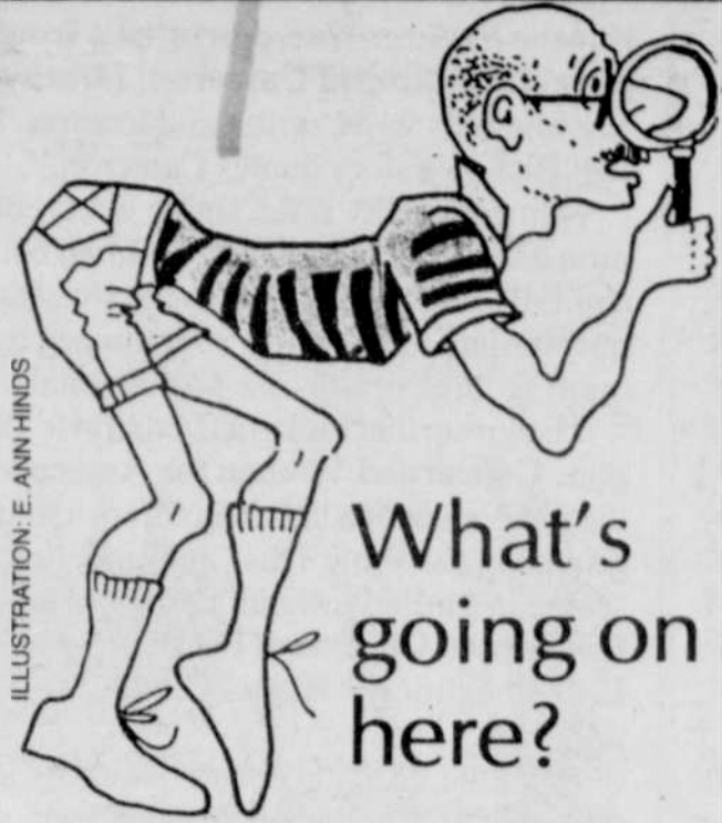
ILLUSTRATION: E. ANN HINDS

F ull page ads for Ansell International's Lifestyles condoms appeared in gay newspapers in ten major markets during June. The copy is similar to Lifestyles ads which have been running in