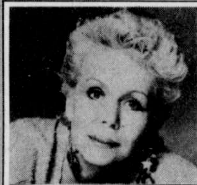
Louise Hay Tuesday, July 14 8-9:30 pm By Donation

New Thought is a synonym for growth, development and perpetual progress. From individual, personal peace we create a peaceful planet.