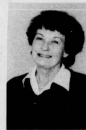
Sales Associate of the Month: