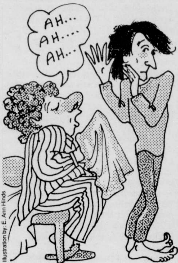
Illustration by: E. Ann Hinds

have had the experience of contacting one of these colds or flu when we are stressed or otherwise more strained. This is the area that I will concentrate on in next month's continuation of this article.