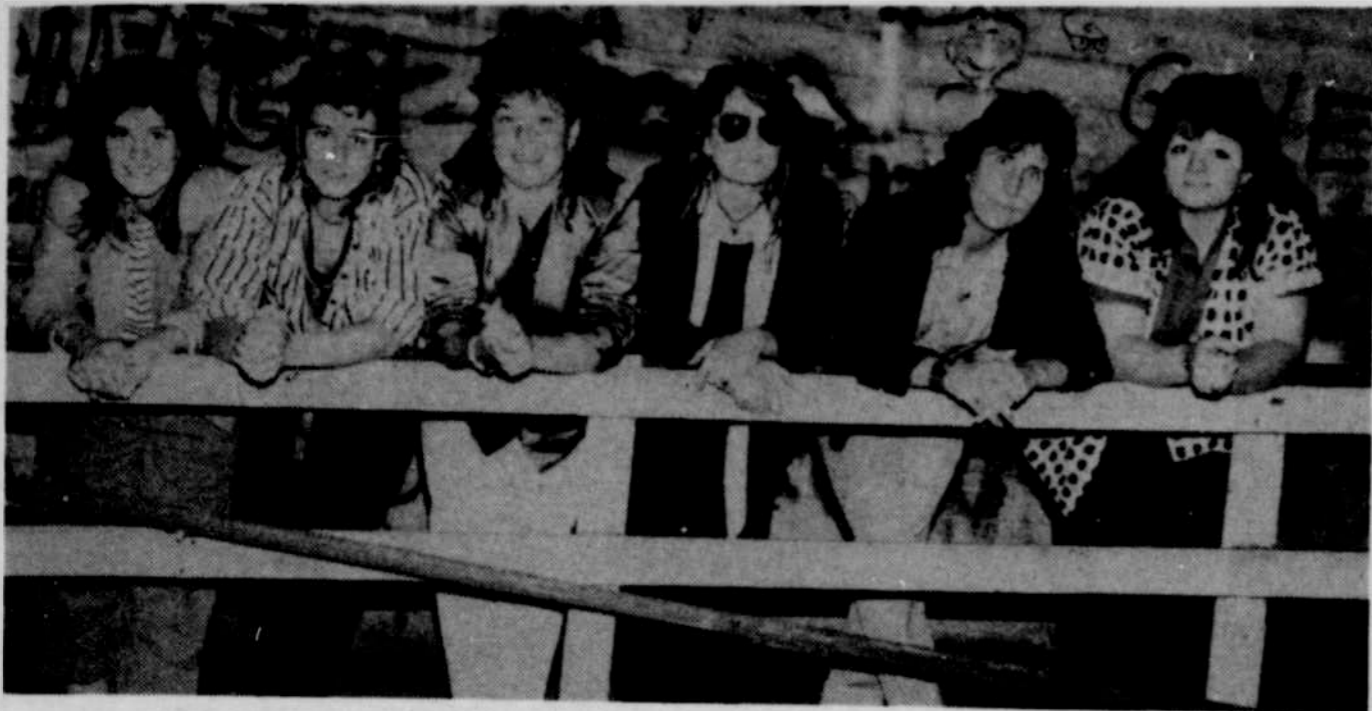
Transister, an all woman rock band, performs at The Primary Domain