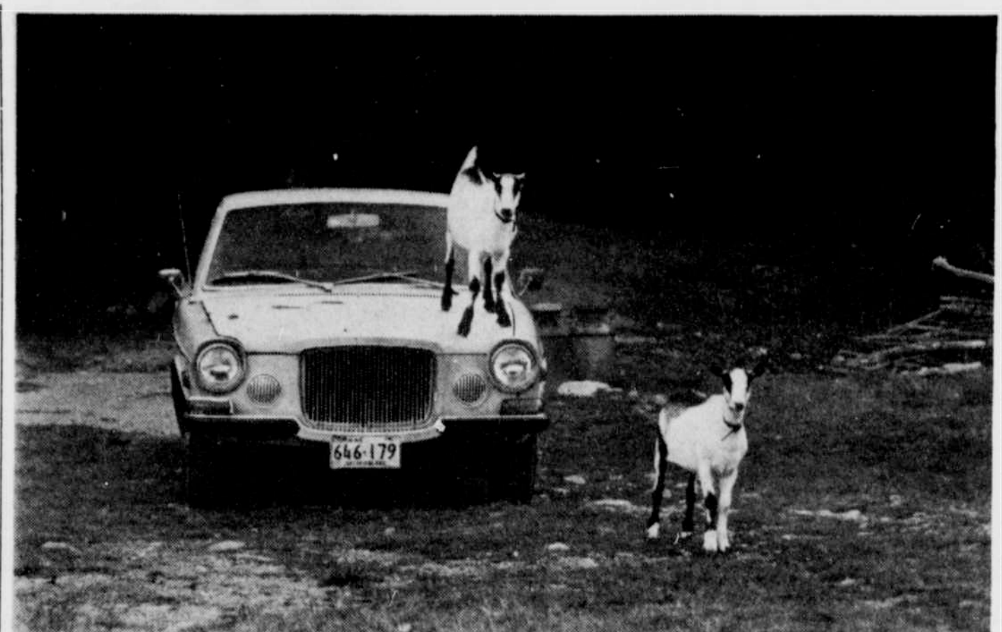
Kids these days.