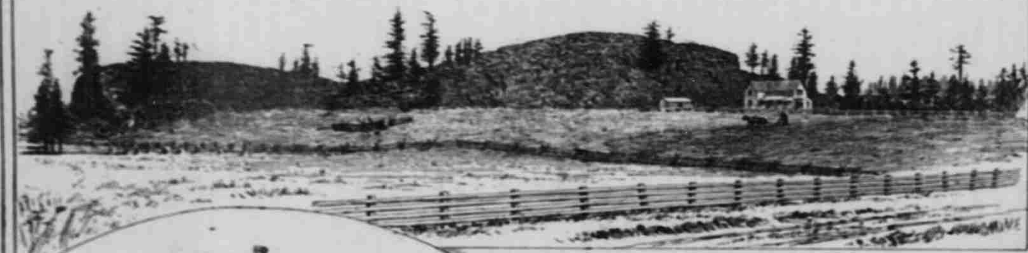
PROPOSED SITE FOR WATER WORKS RESERVOIR