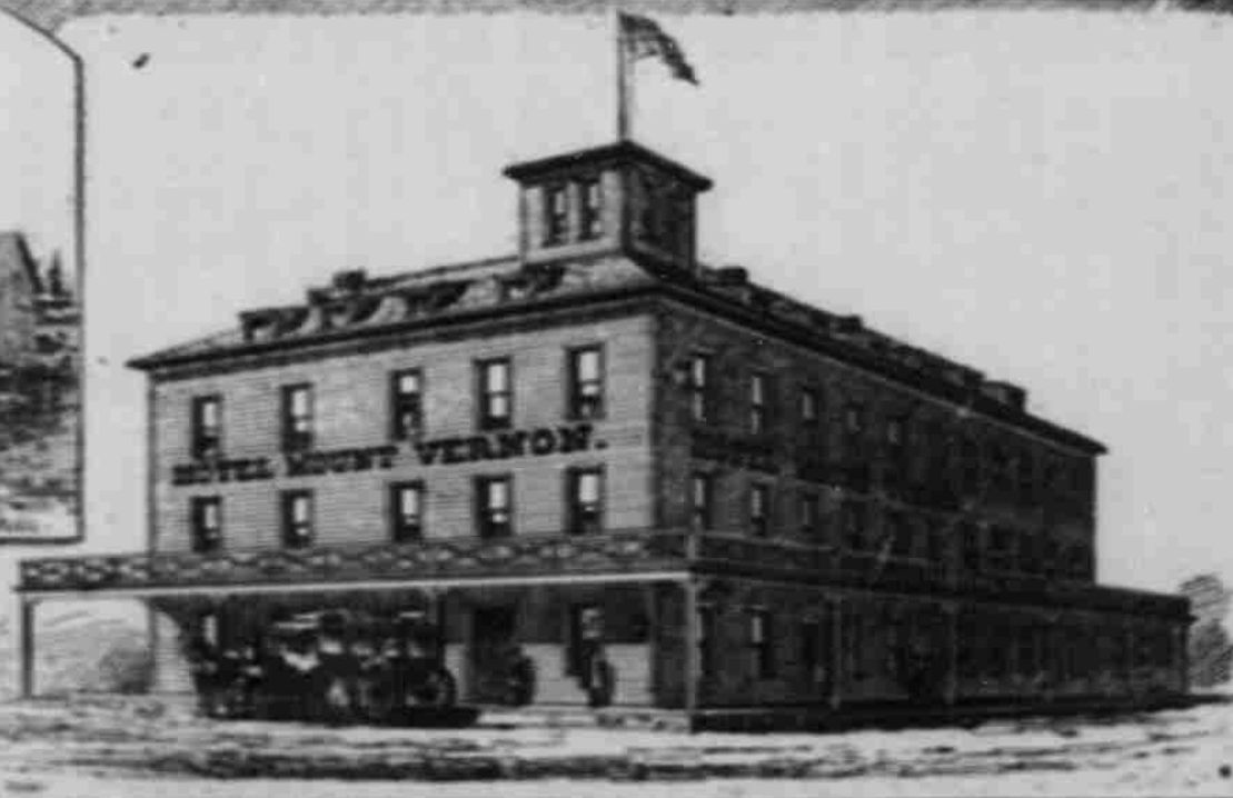
WASHINGTON—FRANCHISE AT FORT FALLS.