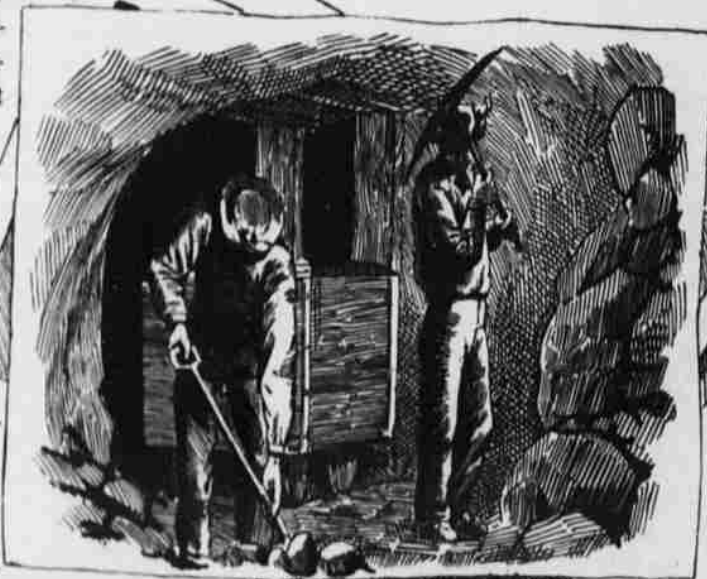
MINERS AT WORK.

plant at Oswego, with the idea in view of more fully