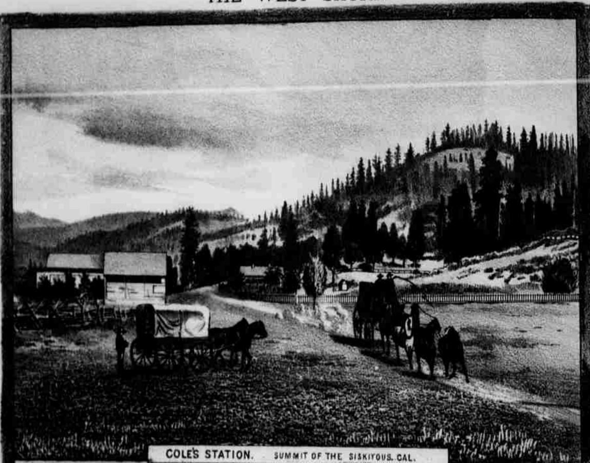
COLE'S STATION. - SUMMIT OF THE SISKIYOU, CAL.