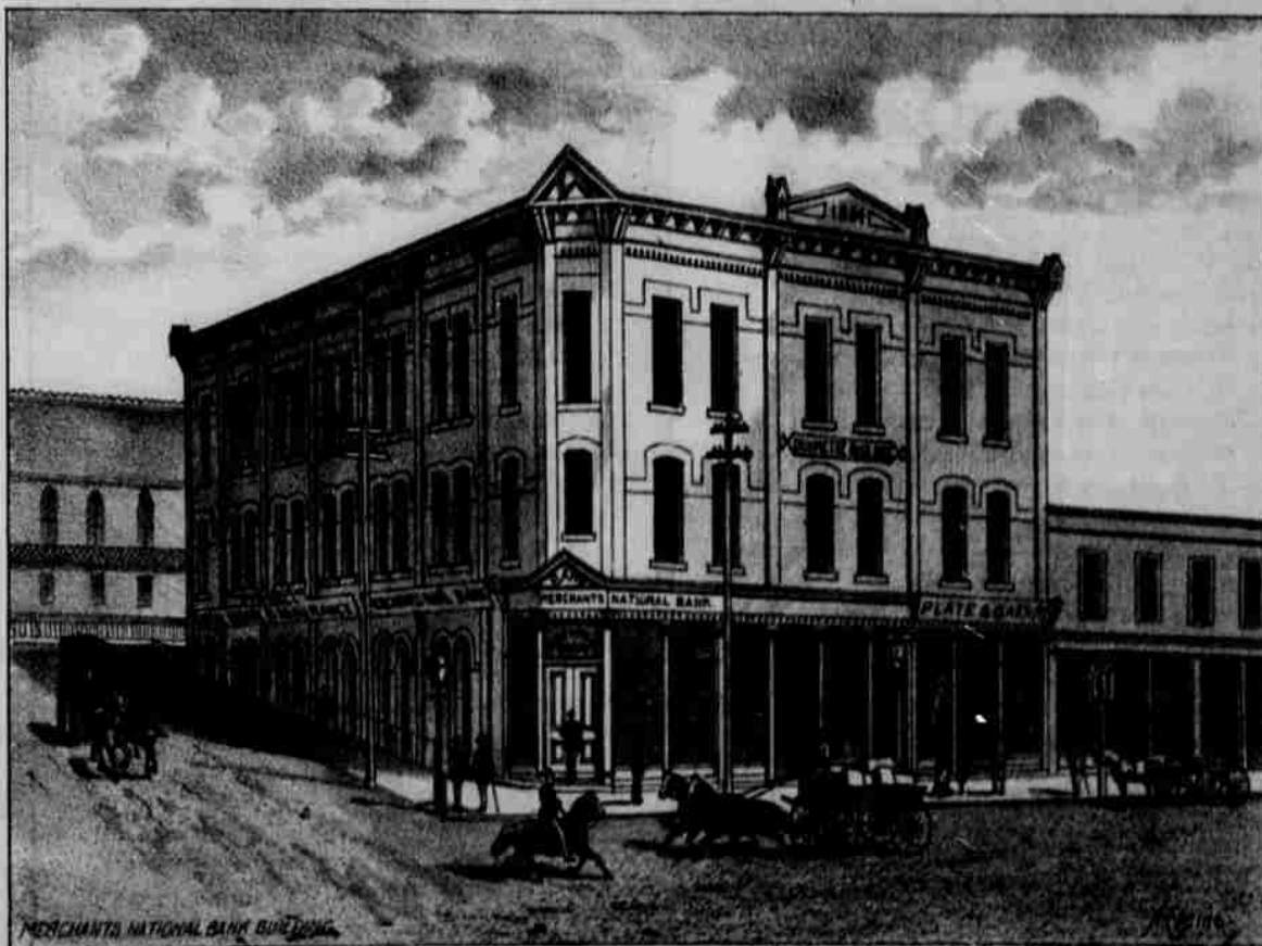
MERCHANTS NATIONAL BANK BUILDING