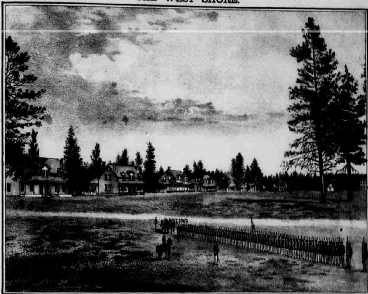
IDAHO.— FORT COEUR D'ALENE.