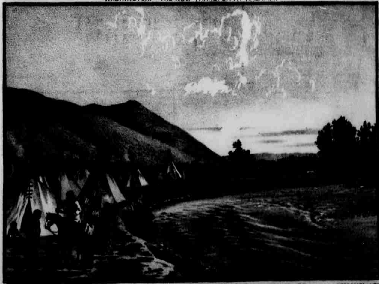
WASHINGTON.— AN INDIAN CAMP AT UNION GAP, YAKIMA RIVER.