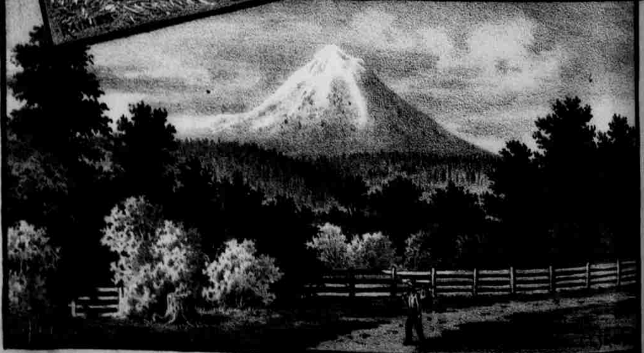
MONARCHS OF THE CASCADES.