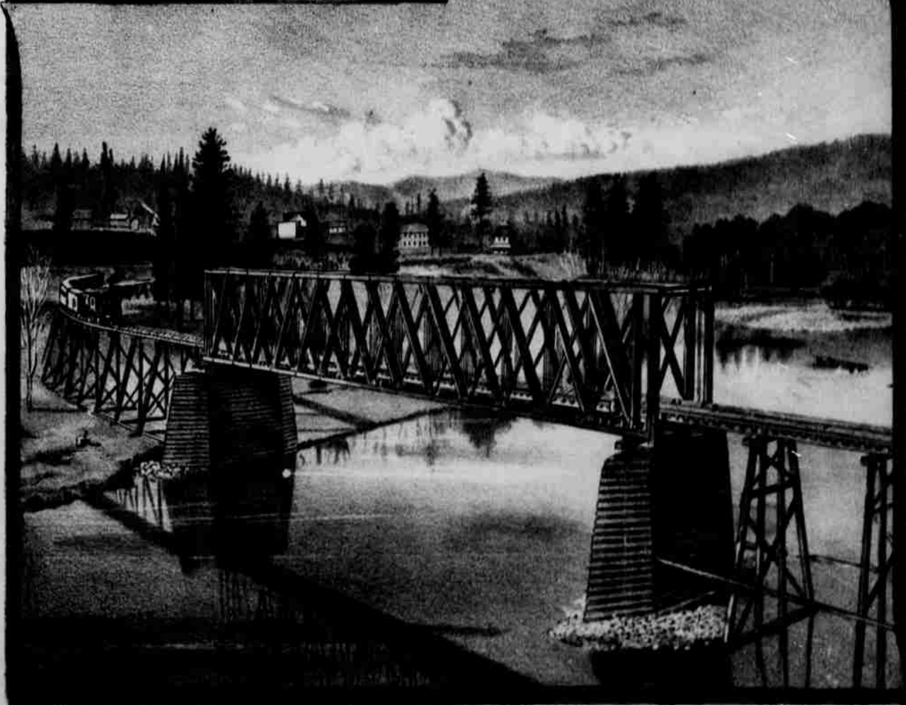
HOOD RIVER CROSSING, OREGON.