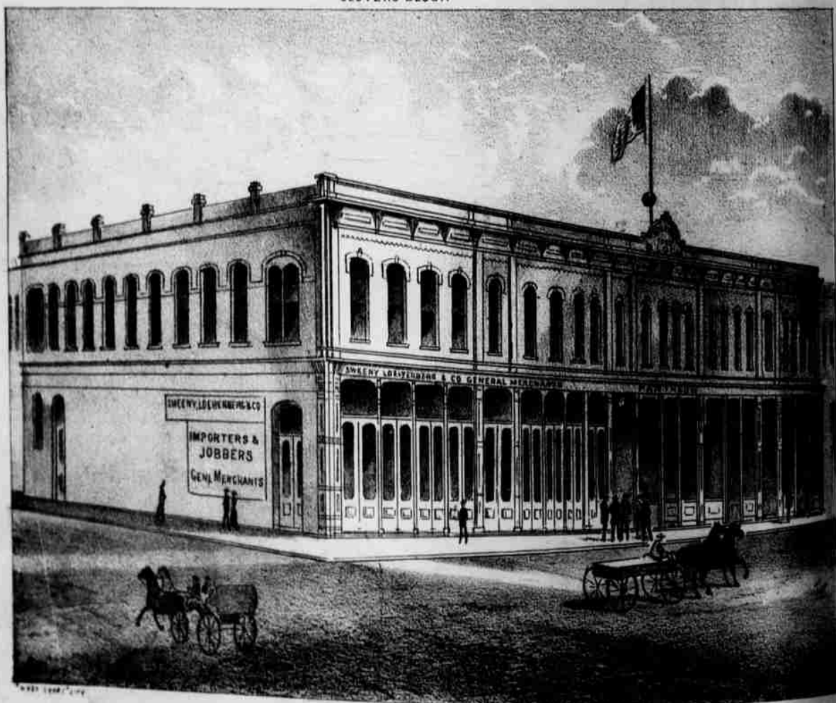
SPOKANE FALLS, W.T.