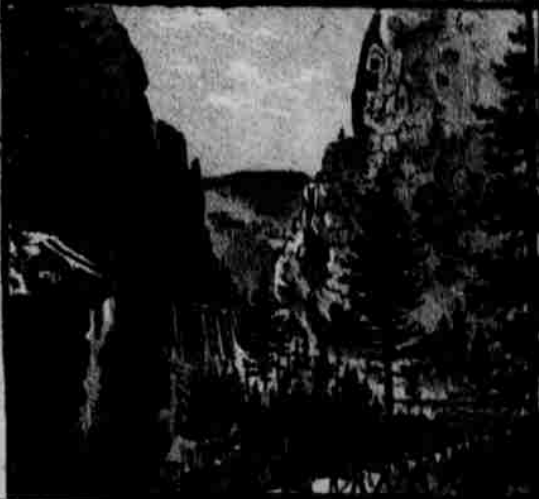
AVALANCHE GULCH, MONTANA.