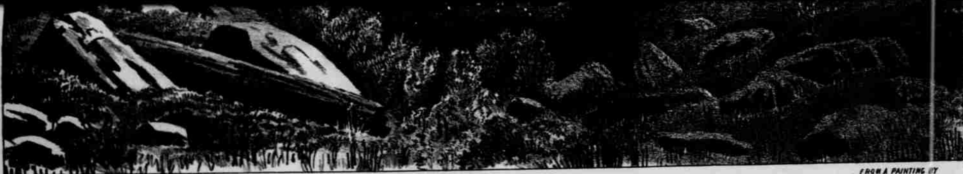
MOUTH OF THE WILLAMETTE RIVER.