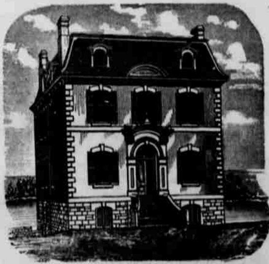
CUSTOM HOUSE, VICTORIA.