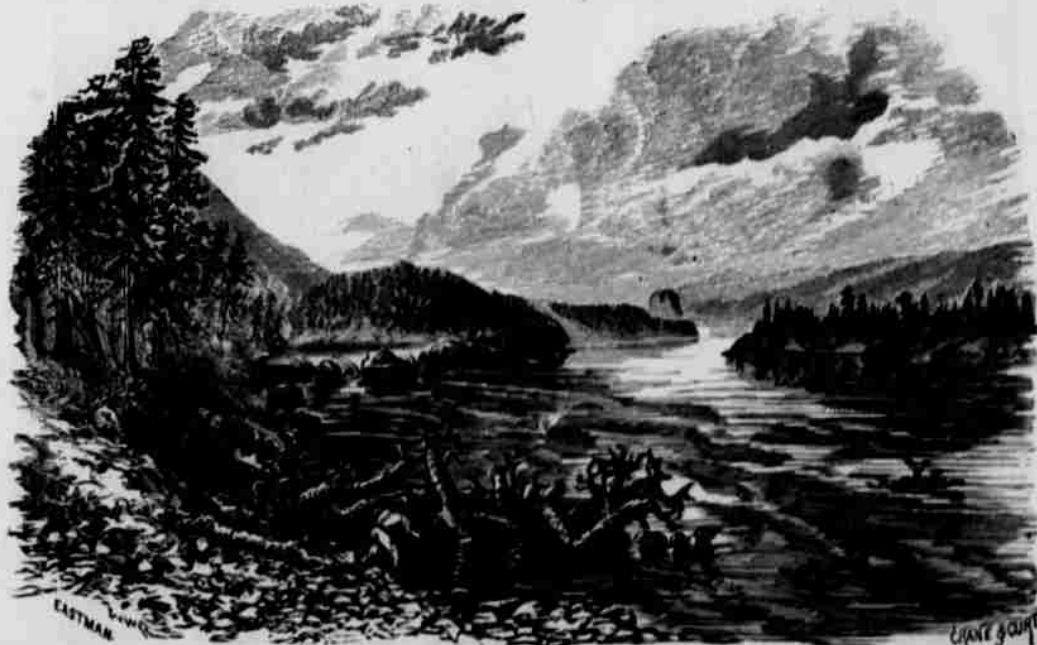
A VIEW ON THE COLUMBIA RIVER—CASTLE ROCK IN THE DISTANCE.

total wheat crop of 1846, including at that time nearly all of Washington Territory, was 150,000 bushels. The wheat crop of 1880, Oregon alone, from 444,665 acres, was 7,896,611 bushels. The total value of all productions for the year, exclusive of the season's wool clip, about 8,000,000 lbs., and increase in live stock, amounted to $12,815,976.—There are in the State, 14,466