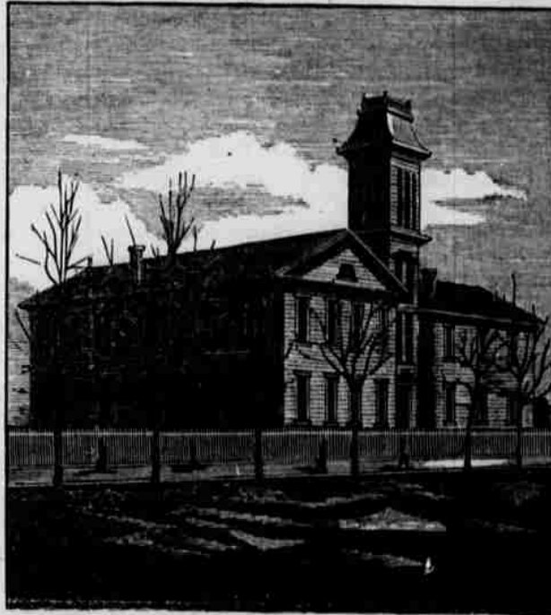
OREGON AGRICULTURAL COLLEGE AT CORVALLIS.