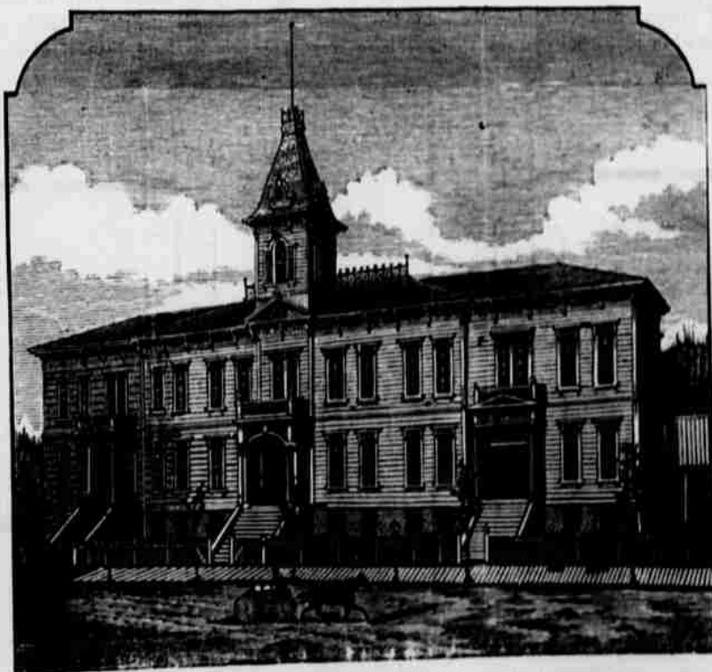
HARRISON ST. SCHOOL, PORTLAND, OR.

There were 111 pupils present the first day.