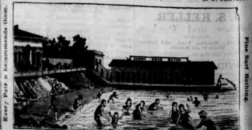
Every Patron recommends them.