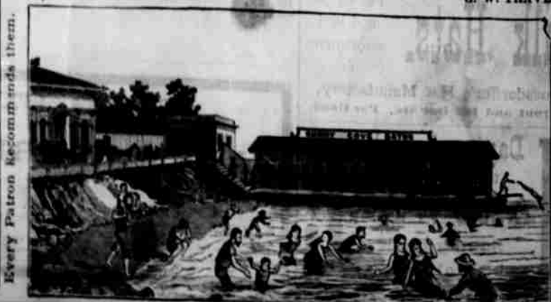
Every Patron Recommends them.