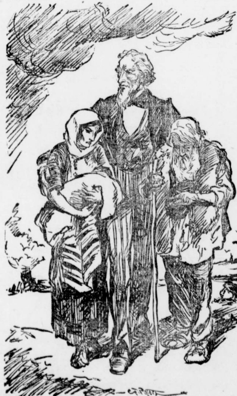
ARMENIA AND SYRIA" ANOTHER JOB FOR THEIR UNCLE SAM