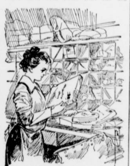
"That Timpkins Boy Has Sent a Valentine to Lissy Edwards."

The last one to appear at the window was Ella Flagg, the little milliner whose shop was next door to the post office. Ella was a faded blond, with light blue eyes and a face that once had been vivaciously pretty, but now was sad and wistful. People had decided that Ella Flagg had begun to droop from the moment that Will Chandler left Littleford and went to California. Some wondered whether Ella ever heard from Will, but Myra could have told them that she did