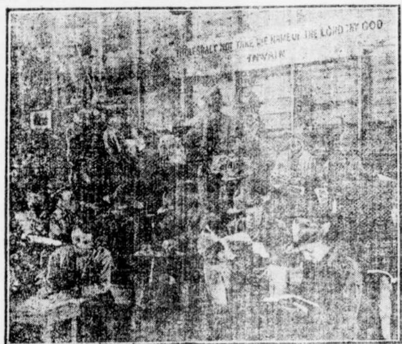
Mess, Games, Good Reading and Correspondence Facilities in Y. M. C. A. Building.

STAMPED WITH STARS AND STRIPES AND RED TRIANGLE