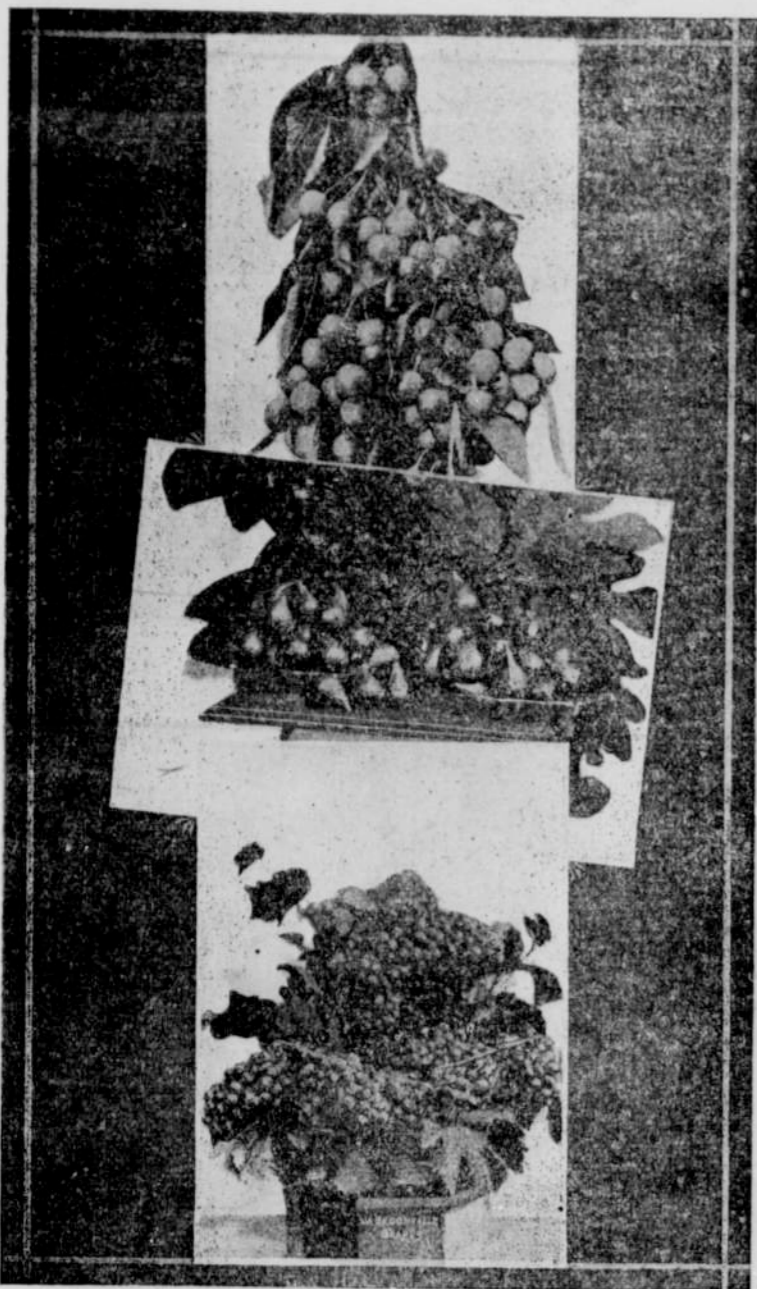
Cherries, Figs and Grapes grown near Jacksonville