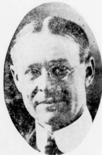
FRANCIS J. HENEY SHOT IN COURT

Three of the plants are up-to-date and ready for immediate operation.