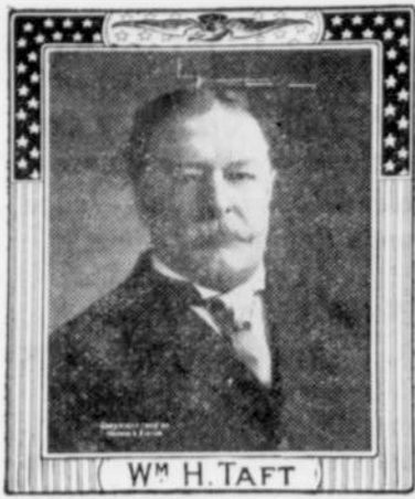
W. H. TAFT

Official Count Required There and in Mis- souri to Decide Who Leads— Colorado Democratic.