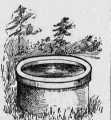
A PROTECTED SPRING.

It is difficult to keep a spring clean and pure, especially if visited by stock, unless one attempts to "improve" a little upon nature, difficult as that might seem. If one can get a section