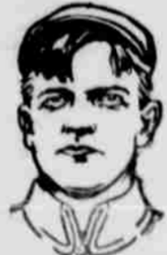
CHRISTY MATHEWSON Pitcher—New York Giants "Tuxedo gets to me in a natural, pleasant way. It's what I call good, honest, comfortable tobacco—the kind to stick to."

When Christy's dead a hundred years, the fans will still discuss his play, and sigh, while shedding briny tears, "There are no men like him today! He used the brains behind his brow, and gave the foe a grievous jar; the chroniclers have told us how he was for years and years a star. Great pitchers came and cut some grass, and died, and then forgotten were; he saw them come, and saw them pass, and still kicked up a mighty stir." The chroniclers will also tell how Christy, when a game was played, filled up the pipe he loved so well, to soothe his nerves, all tired and frayed. He smoked Tuxedo every time, the critic's smoke, the mild and rare, Tuxedo fragrant and sublime, the cool, sweet smoke beyond compare.