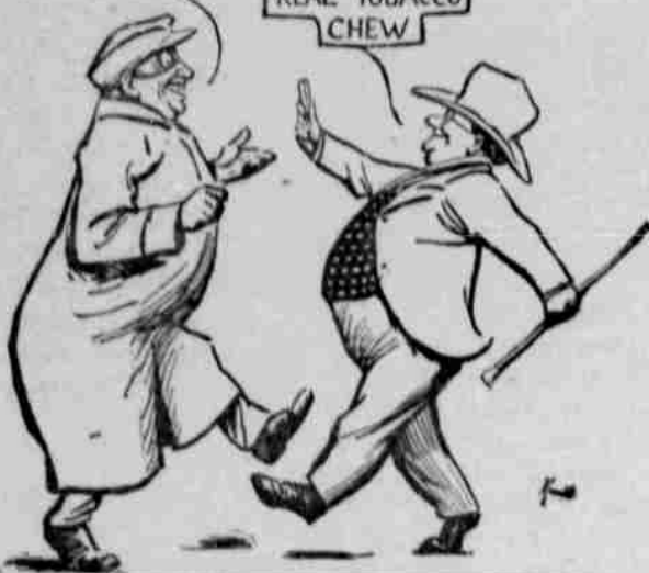
THE AUTOMOBILIST EXULTS WITH THE GOOD JUDGE

YES, a small chew of "Right-Cut" satisfies. It's the Real Tobacco Chew.