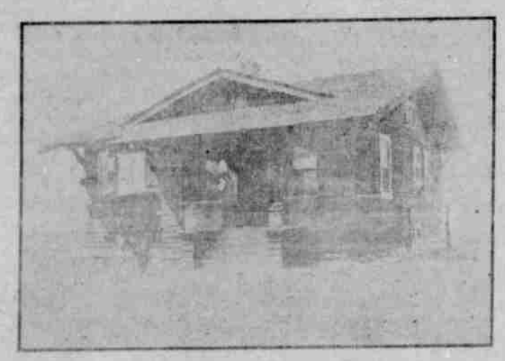
HOUSE AND LOT FOR