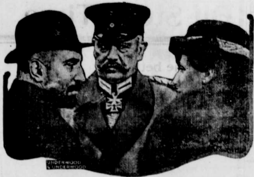
This photograph, snapped the other day in Berlin, shows General von Hindenburg in conference with Hugo Stinnes, Germany's richest man, and Frau Stinnes. Most of the country's largest industrial enterprises and many of its newspapers are controlled by Stinnes.