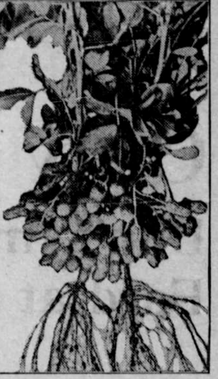
Variety for the Gulf Coast Region.

Most of the so-called varieties of peanuts now to be found in the trade in the United States are merely low-standard varieties with new or local names, and there are only about six distinct varieties grown in this country. This statement is made by the chief of plant industry, in reporting on experimental work with peanuts. This work has included methods of planting,