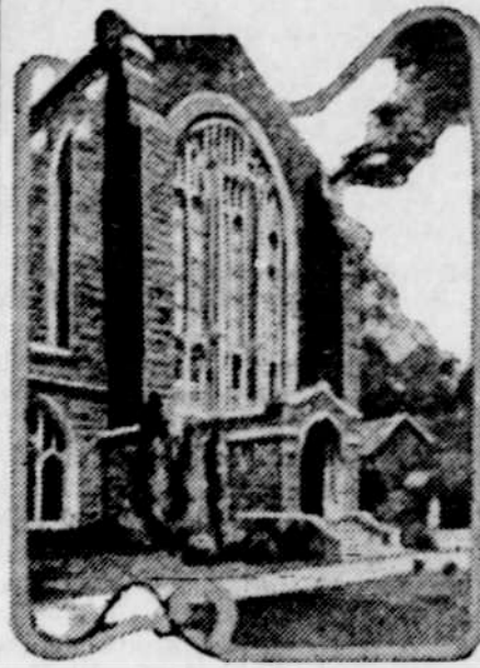
Facade and Main Entrance of the Memorial Chapel.

The cloister is divided into 13 bays, each representing the officers and men from one of the thirteen original states. The interior of the chapel is rapidly approaching completion. Fortyeight panels represent all the states of the Union and symbolize the final achievement of the national group. The glass windows will constitute a national history in themselves. They tell the story of the discovery, settlement, and development of the nation