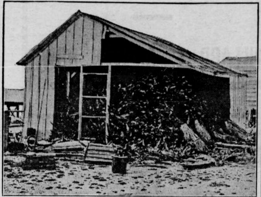
Albatross Wings Piled in Old Guano Shed, Laysan Islands. Evidence of the Extent to Which Poachers Have Killed These Birds. The Wings Stored Here Were Evidently Intended for Shipping, but Never Had Been Cured.

The number of individuals of the exclusive species in 1911 were estimated to be: Six of the Laysan teal, perhaps 100 of the miller bird, 300 of the honey-eater, 2,000 of the rail, 2,700 of