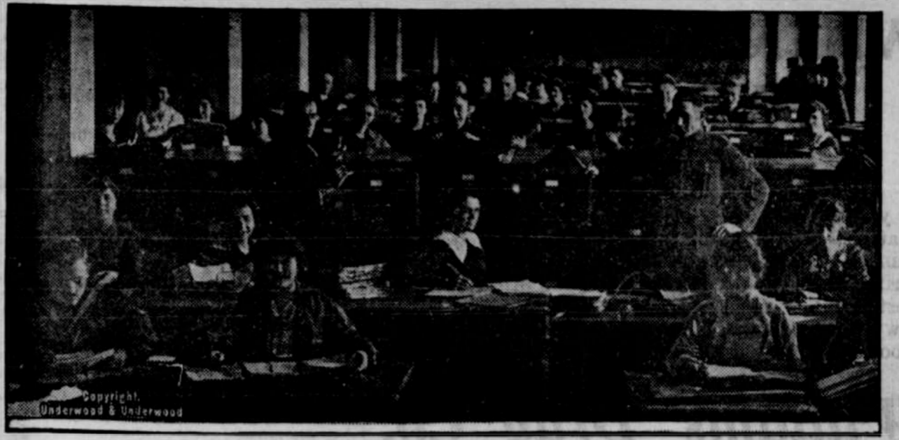
Wholesale cuts in the number of female employees of the bureau of war risk insurance are part of the general plan of the bureau to bring all its employees under the civil service regulations. The places of probably 1,000 of the girls who have been permitted to resign will be taken by an equal number of ex-service men who have qualified by civil service examinations. This photograph shows service men and girl clerical forces working side by side.