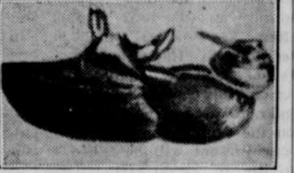
This Beetle Bores Through Lead Sheathing of Aerial Cables—Magnified Ten Times.

Washington.—When telephone girls in California find their wires are "shorted," a bug may be on or in the