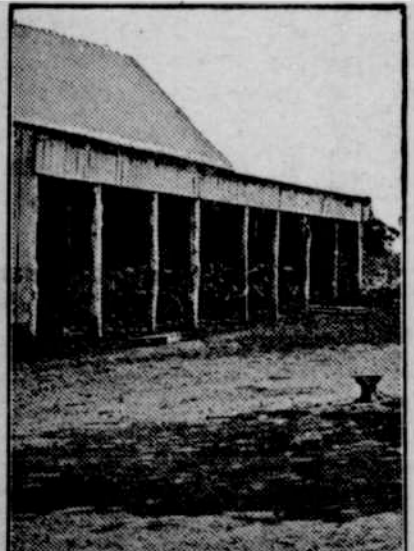
An inexpensive shed for various farm implements.

The material from which the shed is made will depend upon the cost and the locality. Very good sheds are