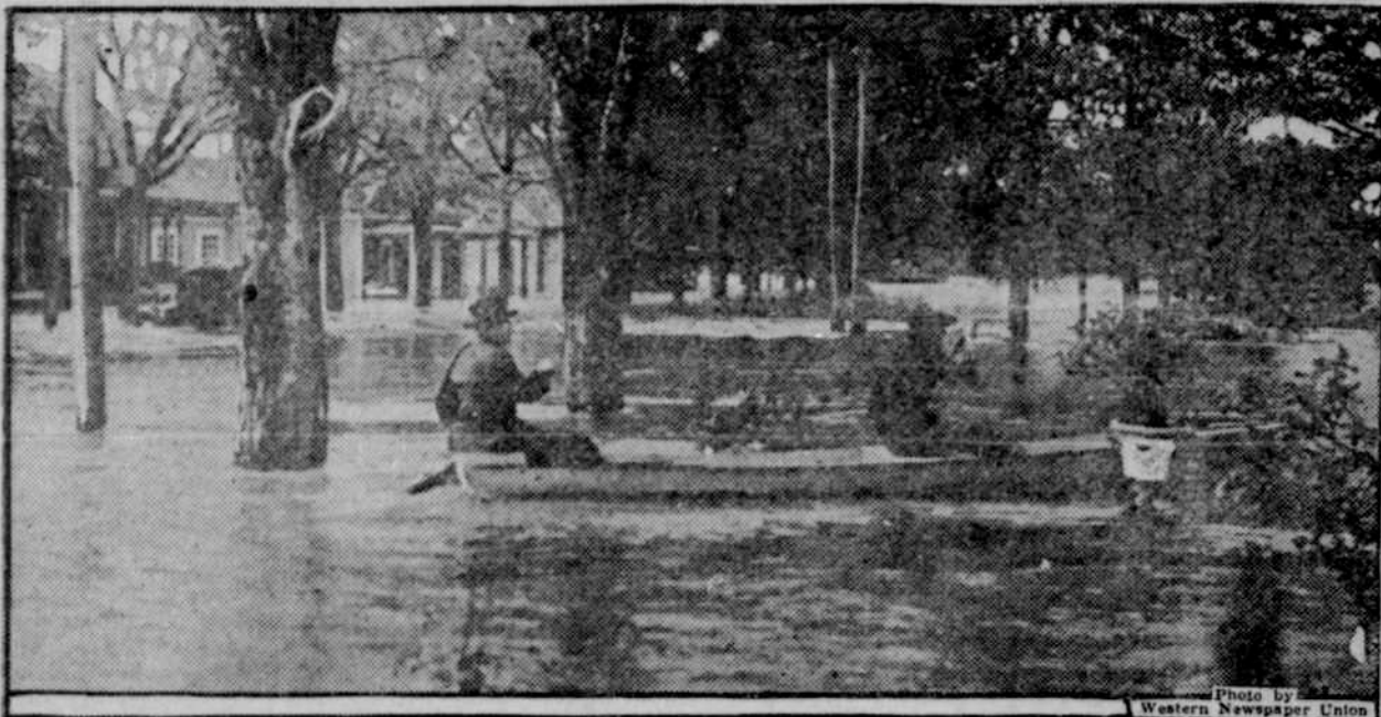
Georgia, Alabama and Mississippi suffered most heavily in the recent floods. Heroic rescue and aid work was done by the Red Cross. The property damage was estimated at many thousands, and over 1,000 persons were made homeless by the rushing waters. Here is a photograph taken at West Point, near Atlanta, Ga., where the Chattahoochee overflowed its banks.