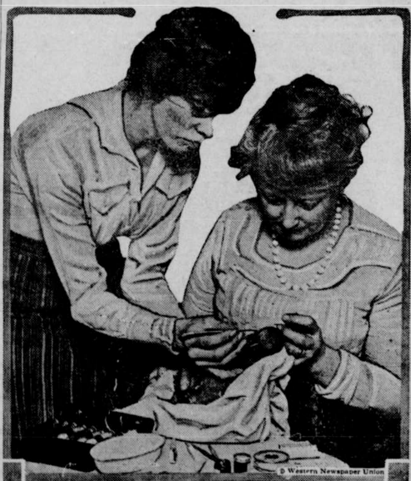
New York boasts of a hospital devoted entirely to the care of birds. The photograph shows two of the "surgeons" removing a tumor from a parrot, an unusually difficult operation.