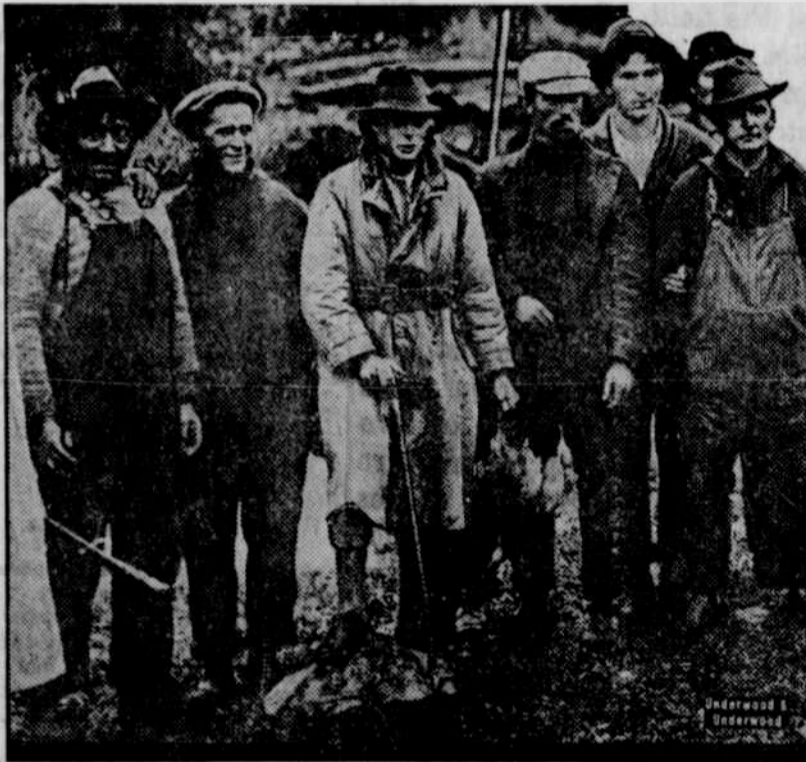
The prince of Wales has been enjoying himself in the Canadian wilderness, fishing and hunting. He is here seen with some of his companions and Indian guides at Cameron falls. The prince is holding a duck.