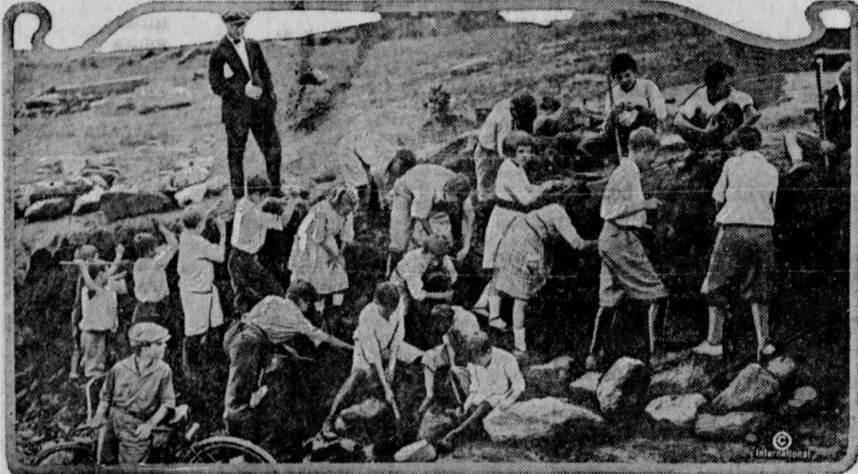
Workmen excavating at Broadway and One Hundred and Sixty-ninth street, New York, unearthed what is said to be the flooring and fireplace of a hut of a camp occupied by the Hessians during the Revolutionary war. The photograph shows children searching the excavation for relics.