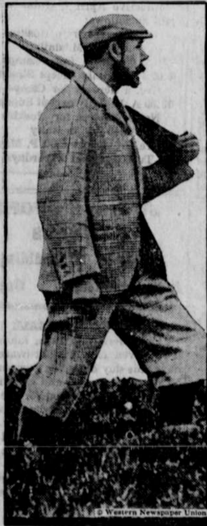
Photograph of King George of England on the "butts" during a grouse hunt. Now that the racking days of war have passed, his majesty finds time for a little recreation, and he is an ardent huntsman.