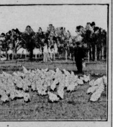
Good Uniform Flock of Chickens.

No humbug! Any corn, whether hard, soft or between the toes, will loosen right up and lift out without a particle of pain or soreness. This drug is called freezone and is a compound of ether discovered by a Cincinnati man. Ask at any drug store for a small bottle of freezone, which will cost but a trifle, but is sufficient to rid one's feet of every corn or callous. Put a few drops directly upon any tender, aching corn or callous. Instantly the soreness disappears and shortly the corn or callous will loosen and can be lifted off with the fingers. This drug freezone doesn't eat out the corns or callouses but shrivels them without even irritating the surrounding skin. Just think! No pain at all; no soreness or smarting when applying it or afterwards. If your druggist don't have freezone have him order it for you.—Adv.