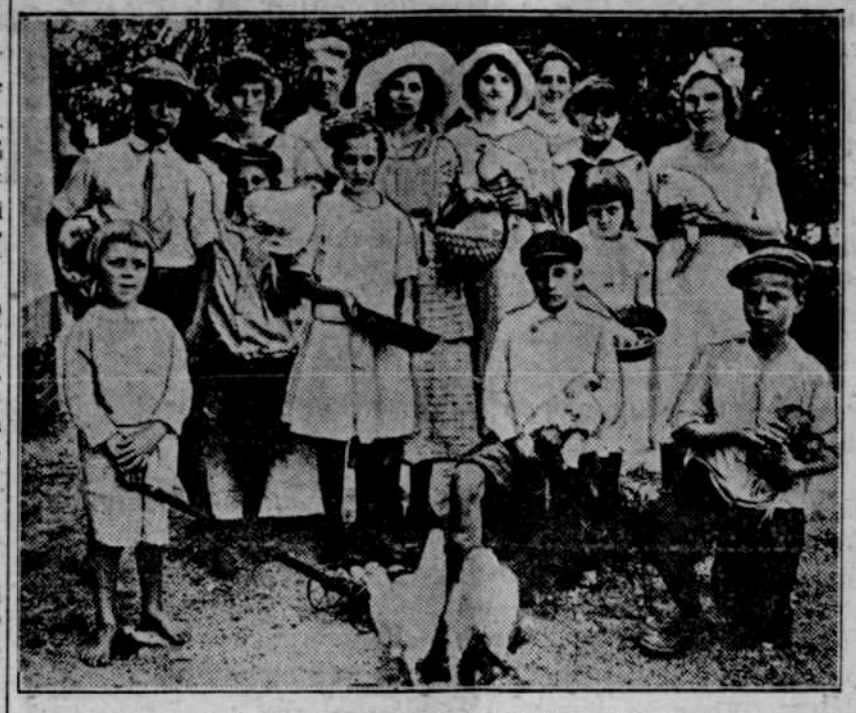
A Meeting of a Typical Poultry Club.

That 'organized agricultural club work among boys and girls is something more than a contest which ends with the season, but a continuous, constructive piece of work which eventually leads the club members into the business of farming and home making is illustrated by the accomplishments of a poultry club member in Ver-