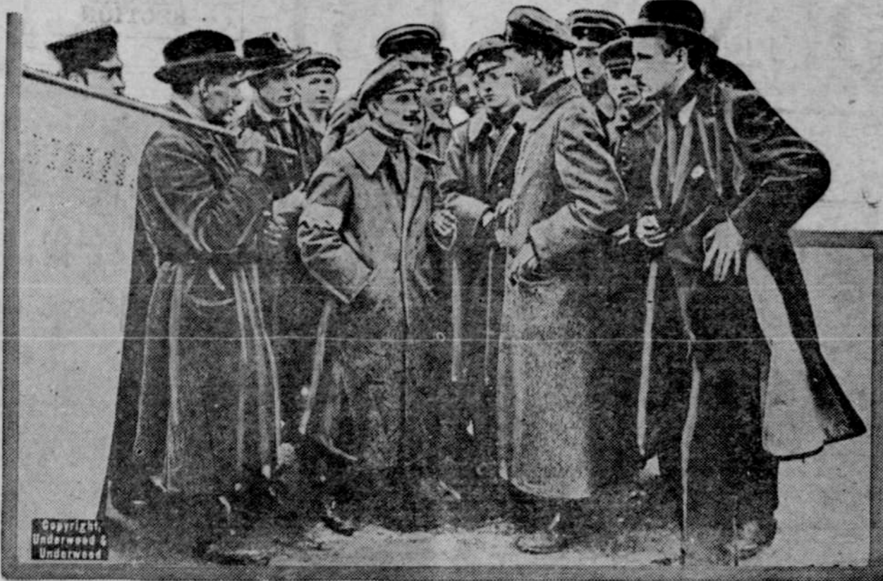
Spartacans and government troops in Berlin talking of the possibility of a cessation of hostilities. The Spartacans carry a white lino curtain as a flag of truce.