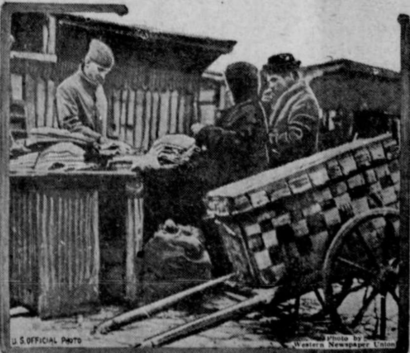
American soldiers of the Russian expeditionary forces, who are fighting the bolsheviks near Archangel, shopping at one of the numerous little stands that are located all over the city of Archangel.