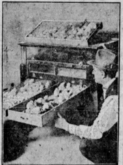
Removing Hatch From Incubator.

The eggs usually are turned for the first time at the end of the second day, and twice daily through the eighteenth or nineteenth day. The eggs are cooled outside the hatching chamber once daily after the seventh and up to the nineteenth day. Moisture should be furnished in artificial incubation