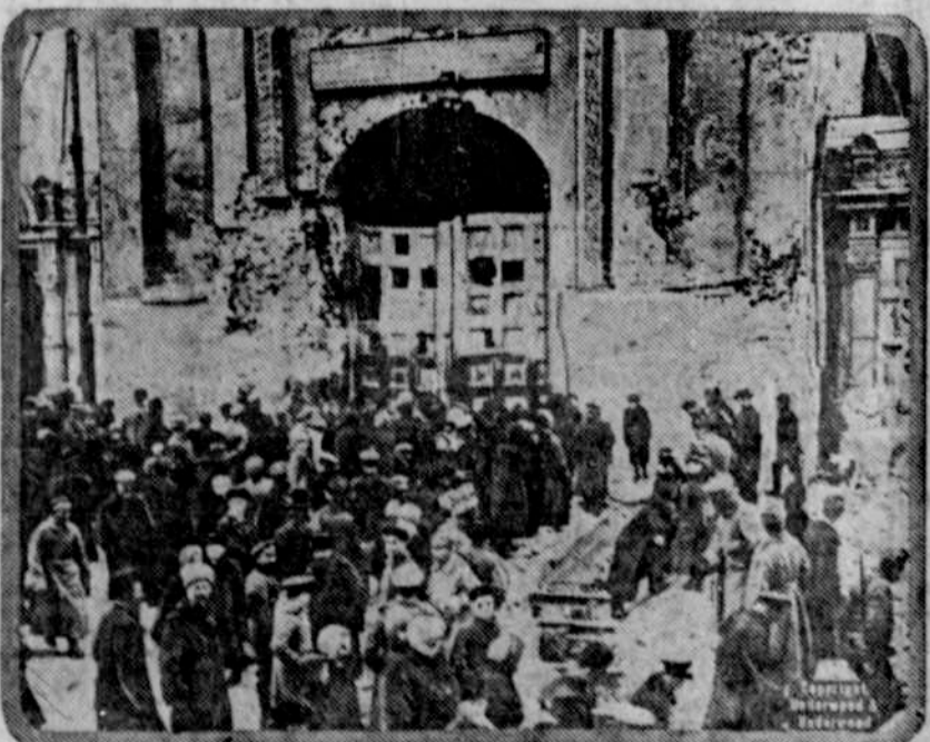
Photograph of one of the entrances of the famous Kremlin in Moscow, showing the gates and walls battered by the gun fire of the soviet troops, some of whom are seen near the building.